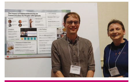
The results of research on the use of zoom in running sessions attracted plenty of attention at the Philadelphia conference.