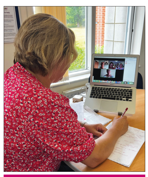
Zoom sessions will now form a permanent part of Dyscover's services.

Since the start of the pandemic in 2020, we have delivered a total of 507 online group sessions, providing weekly support to more than 100 individuals with aphasia.