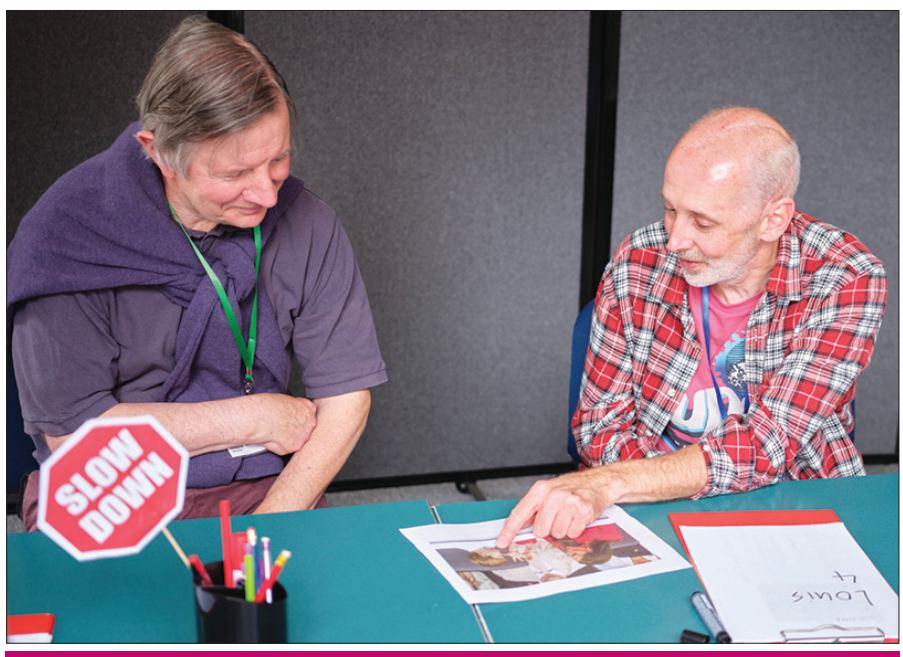
Group members become adept at using communication aids to help get their message across.

Of members surveyed, 87% told us it was 'very important' that they could 'meet people like me'.