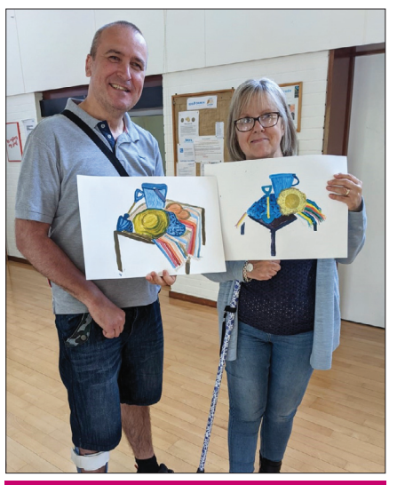
Art sessions are always popular – and the results speak for themselves.

Our expert partners also benefit, by learning about aphasia and developing more inclusive services. This year, challenge programme providers included Leatherhead Golf Club, Bookham Rifle Range, Dorking Swimming Centre, Companion Cycling and Panther Pilates. Art and music experts have also delivered taster sessions for members with creative interests.