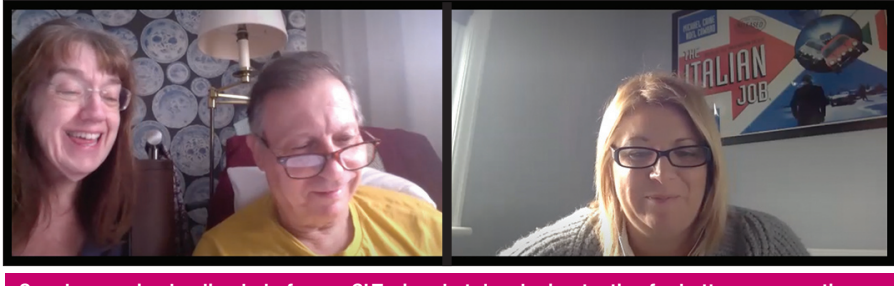
Couples received online help from a SLT, aimed at developing tactics for better conversation.

80% of people receiving this support have gone on to join a regular Dyscover group.