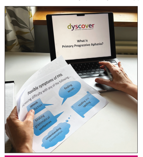
People with PPA find it very helpful to have more information about the condition.

All our PPA services are delivered by a specialist SLT . This year 23 people with PPA received advice and signposting. We supported 12 people and their family members